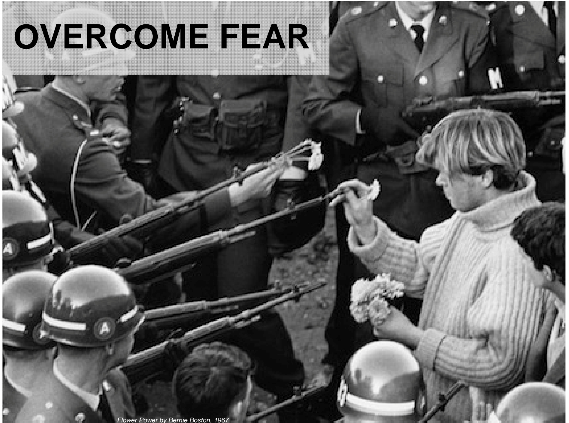
Flower Power by Bernie Boston, 1967