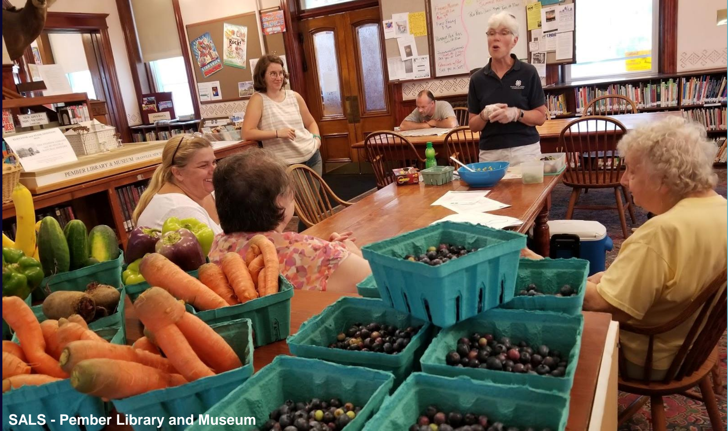
SALS - Pember Library and Museum